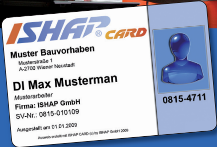
A badge as evidence that its holder is a certified worker at a construction site